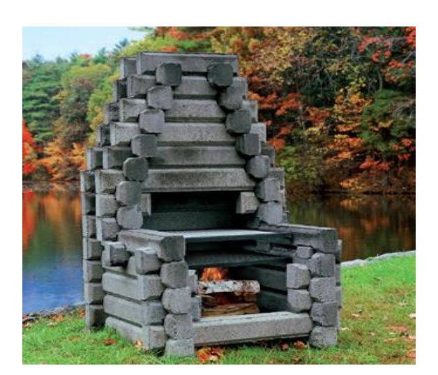
Our most popular model, The Acadia, also comes standard with two 24" x 26" grills. 3 1/2' w x 3 1/2' d x 6' h. Weight: 1,750 lbs. $1,499.00