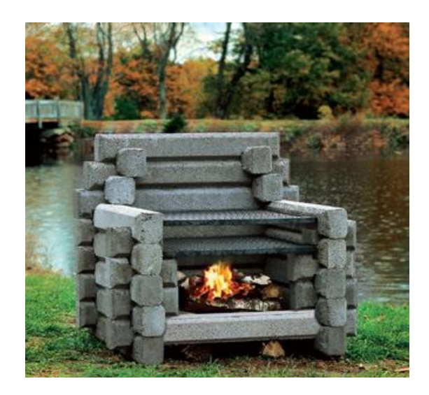
The Deluxe 5 Logger model comes standard with two 24" x 26" grills. 3 1/2' w x 3' d x 3 1/2' h. Weight: 1,100 lbs. $849.00