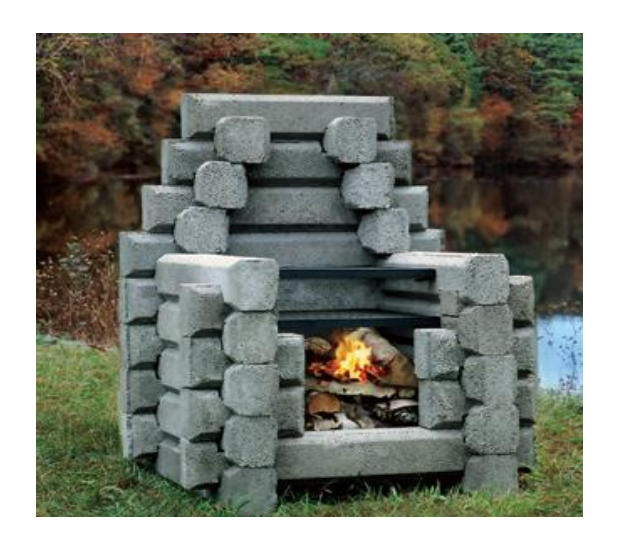
The Moosehead fireplace comes standard with two 18" grills.3' w x 3' d x 3 1/2' h. Weight: 900 lbs.